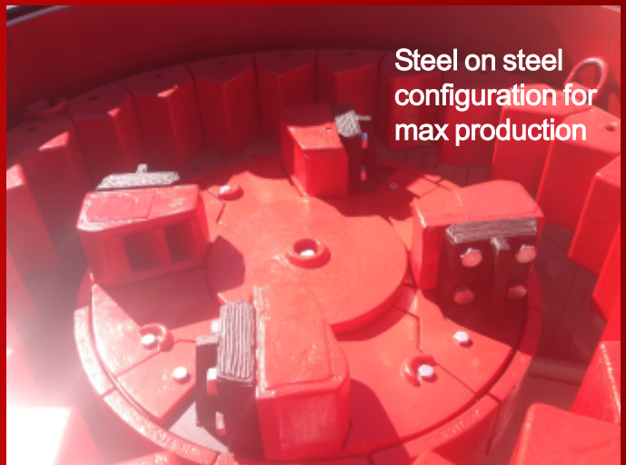
Steel on steel configuration for max production