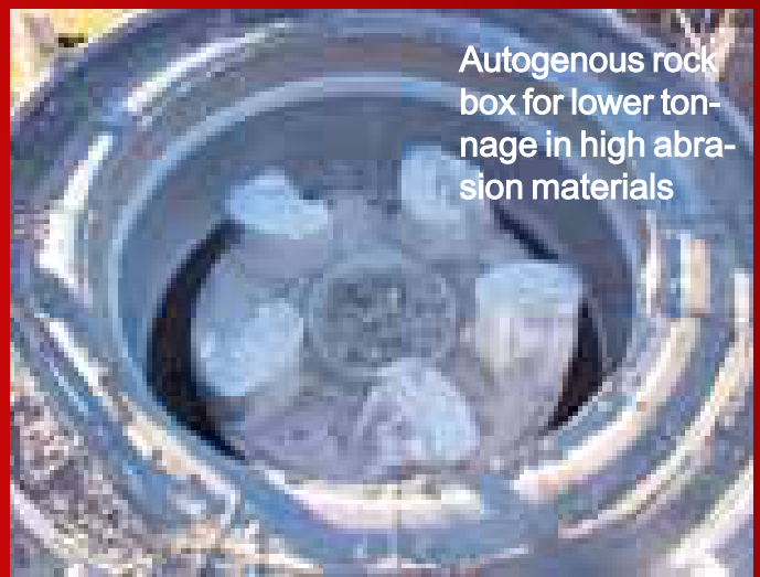
Autogenous rock box for lower tonnage in high abrasion materials